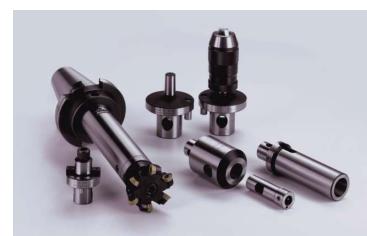
Weldon, morse, milling and drill chucks adaptors