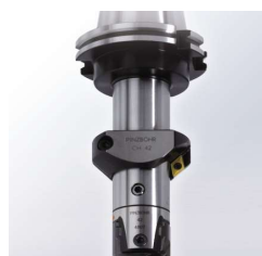
45° chamfering heads